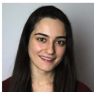
Danielle Benesch 2021 Student Conference Award

For the 2021 calendar year, we have two student award recipients.